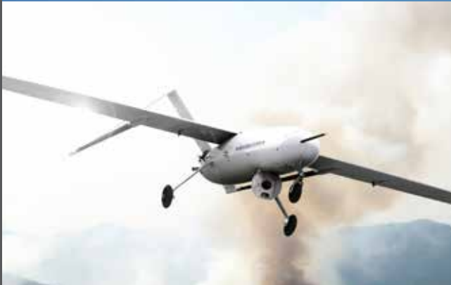
Day and Night Imaging